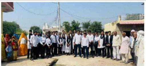
गांव हसन पुर में कानूनी साक्षरता शिविर के आयोजन के दौरान जी डी गोयनका का छात्र।

सोहना। कानूनी सहायता समिति, स्कूल ऑफ लॉ, जीडी गोयनका विश्वविद्यालय, सोहना, गुरुग्राम, हरियाणा में कानूनी साक्षरता शिविर, ग्राम पंचायत, हसनपुर के सहयोग से वर्तमान परिदृश्य में कोविड 19- प्रोटोकाल का महत्व पर एक कानूनी साक्षरता शिविर आयोजित किया है। कानूनी सहायता समिति के अधिवक्ताओं